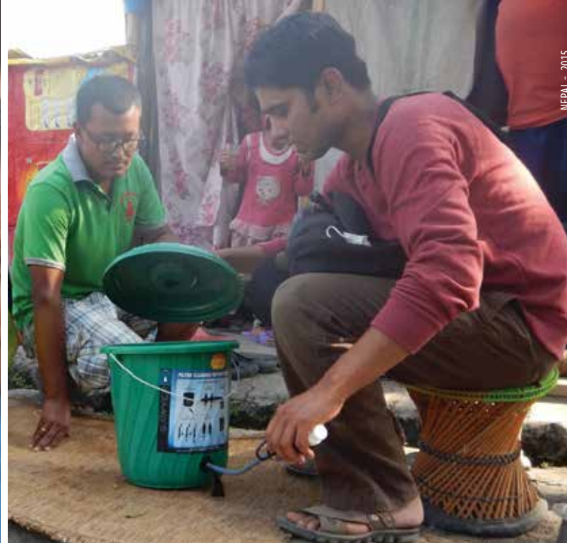
NEPAL - 2015