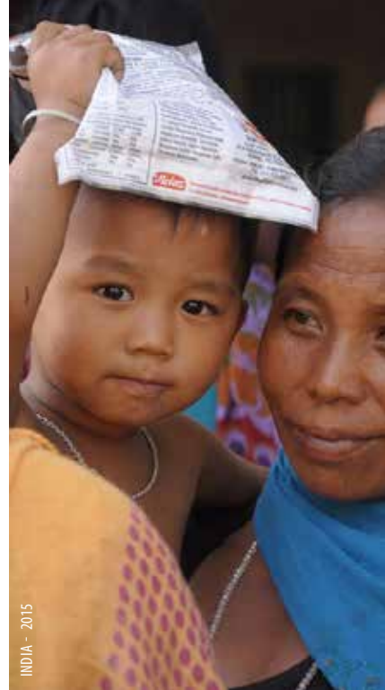
INDIA - 2015

10,000 packets of nutrition drinks provided to patients supported by Hope Foundation.