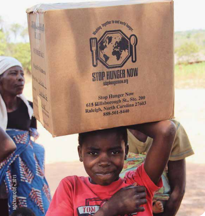
MOZAMBIQUE - 2015