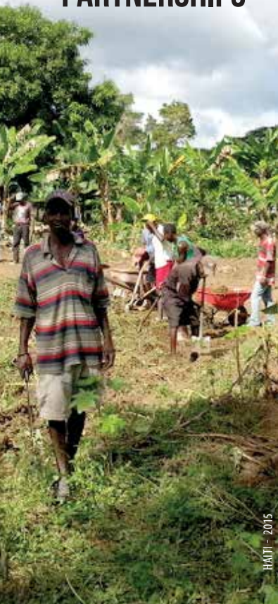
HAITI - 2015

With many of our in-country partners, our relationship goes beyond providing nutrition through meals. From tilapia fish farming to digging wells, we are committed to working with our partners to help our meal recipients become empowered and self-sufficient.